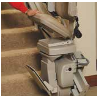
Power folding footrest automatically flips up/down when seat is raised/ lowered.