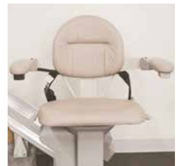
Larger seat and footrest for increased comfort.