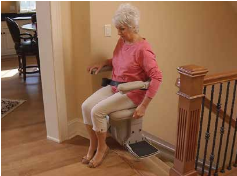
Offset swivel seat makes it easy to get on/off.

“The Bruno stairlift has eliminated an enormous amount of anxiety and stress. We feel grateful for it every day.”