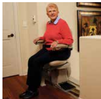
Power swivel seat for effortless exit. Controlled on chair arm or wireless call/send.