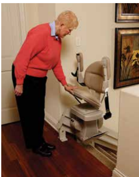
Manual offset swivel seat makes it easy to get on/off. Add the power seat option to make it effortless.