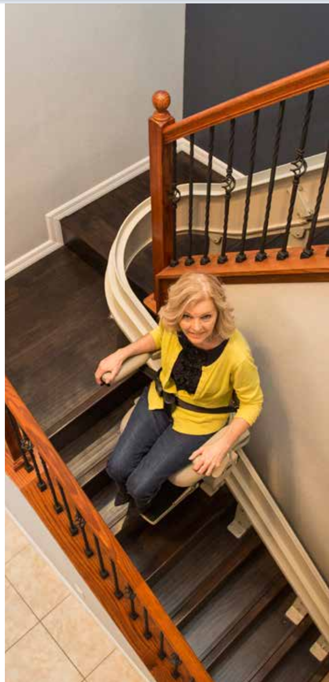
Crafted for a precision fit around curves.