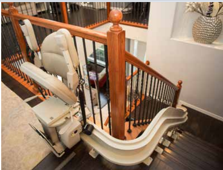
Custom made specifically for your home.