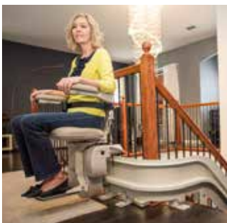
Top or bottom park position extends rail away from the staircase.