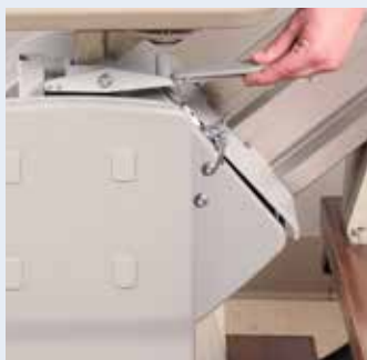
Manual footrest lever. Flip lever to raise footrest without leaning over.