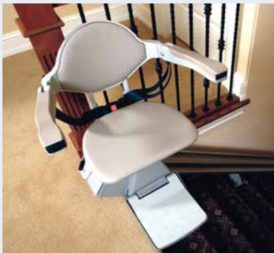
Padded, generous seat.