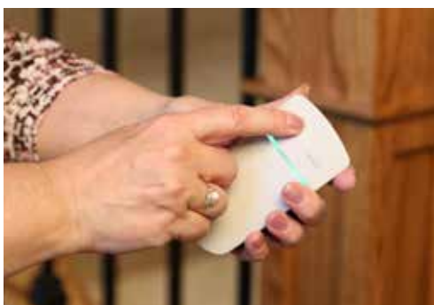
Two wireless call/sends allow remote control access.