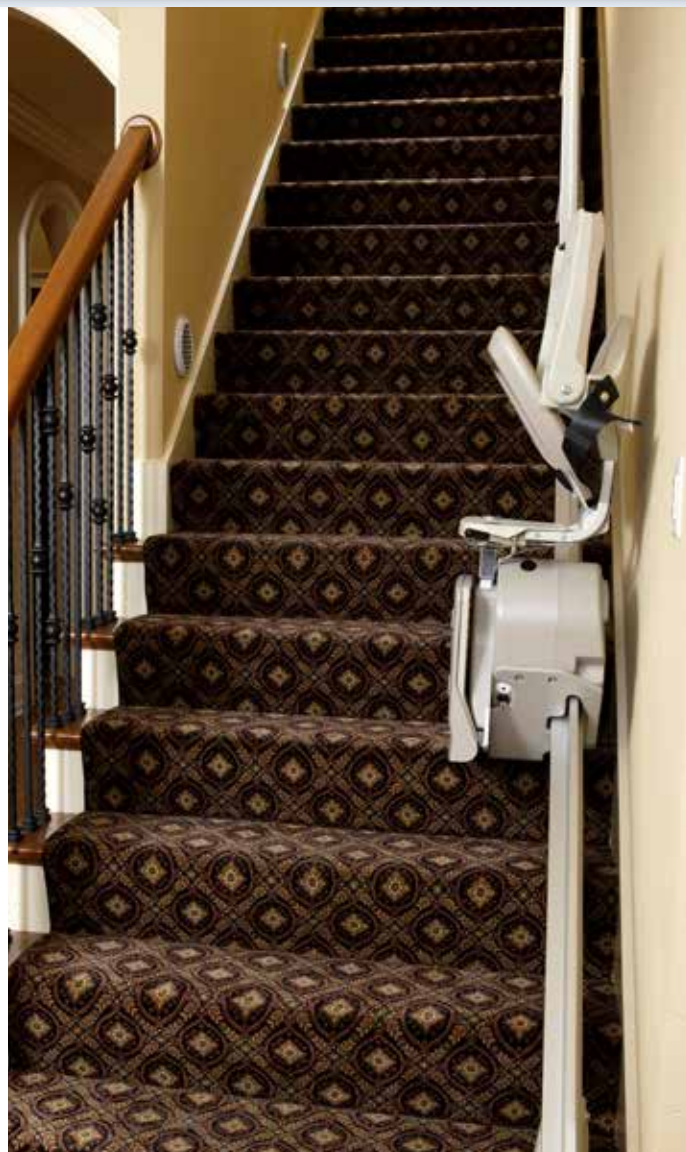
Compact, flip-up design for plenty of open space on stairway.

“Staff was very professional and helpful. The chair is wonderful and I will recommend the product and company.”