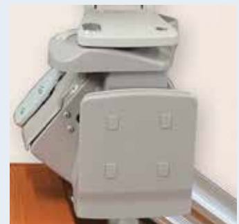
Power folding footrest automatically flips up/down when seat is raised/lowered. Arm switch control optional.