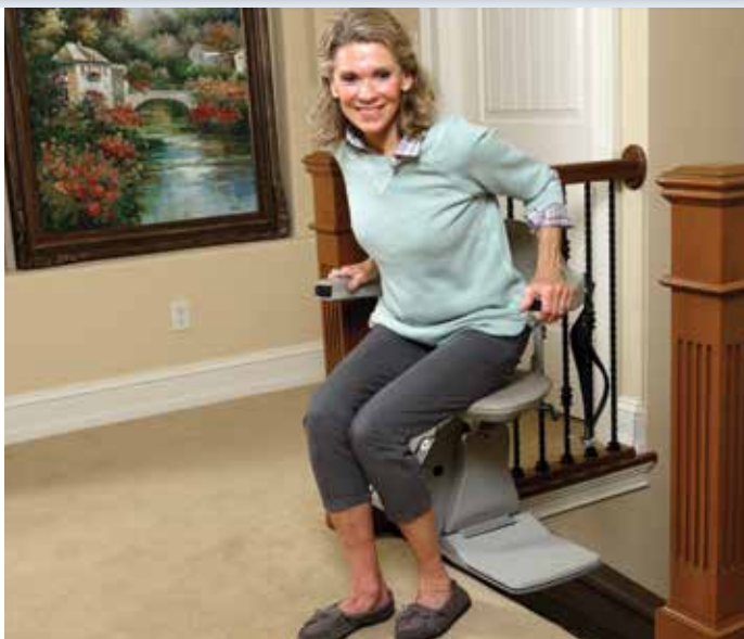
Offset swivel seat makes getting on/off easy.