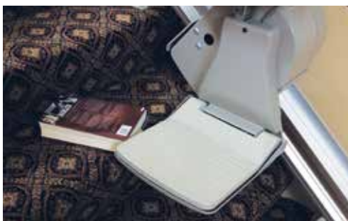
Sensors ensure safety.