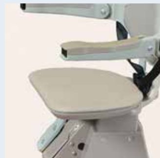
Power swivel seat for effortless exit. Armrest switch control or wireless call/send. Arm switch control optional.